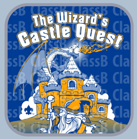
2023 THEME ARTWORK PREVIEW