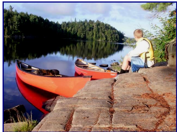
A Scout's first canoe trip - Algonquin Park

are all hand picked outdoorsmen. Most have been Scouters for decades and have canoed Algonquin Park for years. Our Canoe Routes of Algonquin Park is chock full of detailed Guide Notes describing 35 different routes our Guides have travelled.