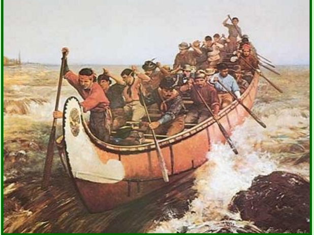
Detail from 'Shooting the Rapids' by Frances Hopkins