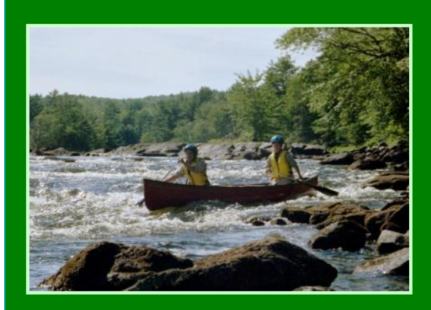
Palmer Rapids, Lower Madawaska River